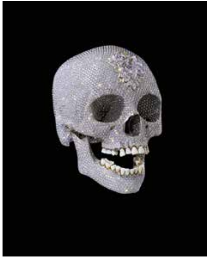
Damien Hirst's Diamond Skull "For the Love of God", Damien Hirst and Science Ltd.